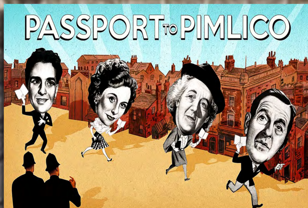
Passport to Pimlico