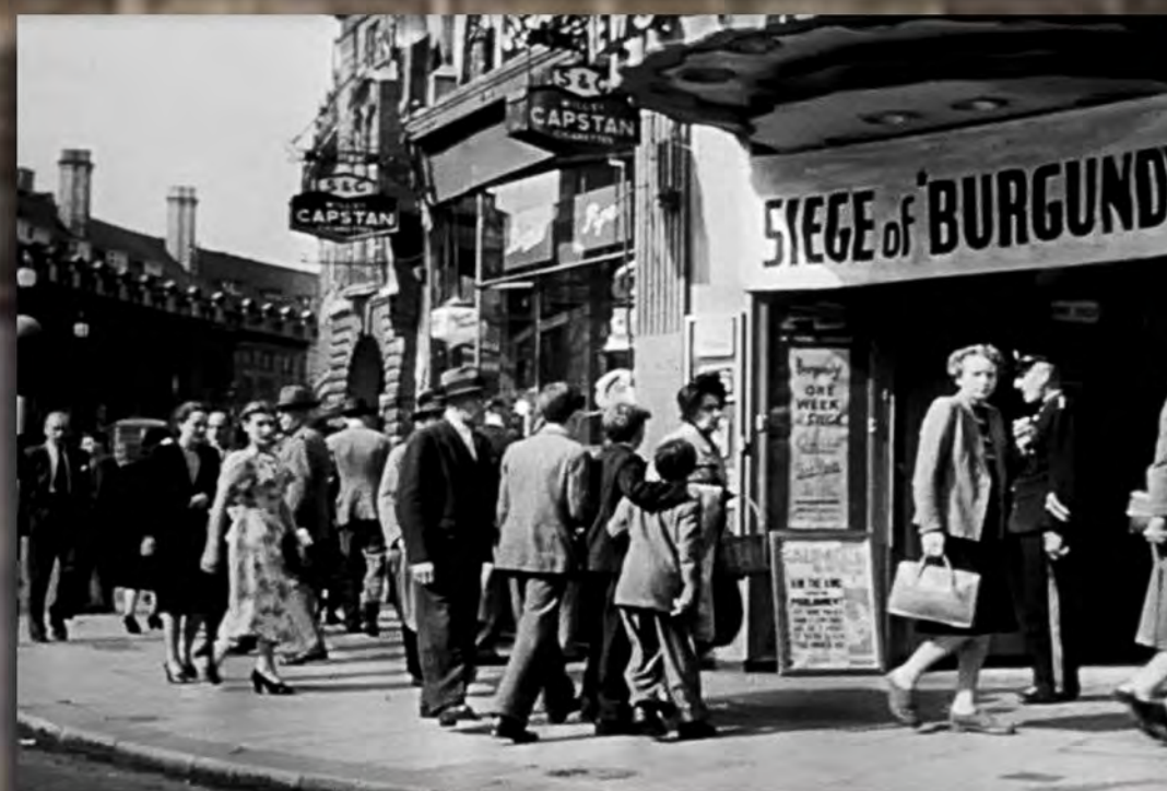
Passport to Pimlico